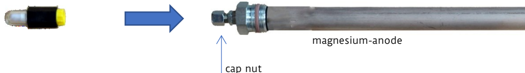
color capsule/consumption display